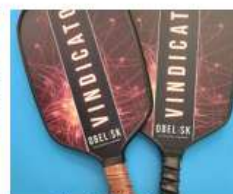
Obelisk Vindicator $95