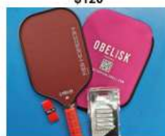
Red Horizon $189