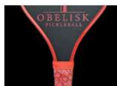
The Tomahawk - Sweetspot training paddle $60