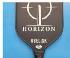
Obelisk Horizon Raw Carbon 16mm $120