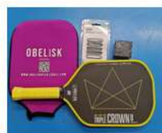
Obelisk Triple Crown II $199