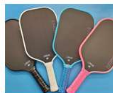
Obelisk Horizon II $165