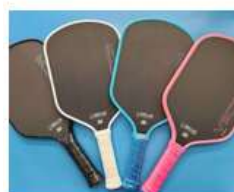
Obelisk Vector $165