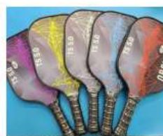
Obelisk TS5.0 $70